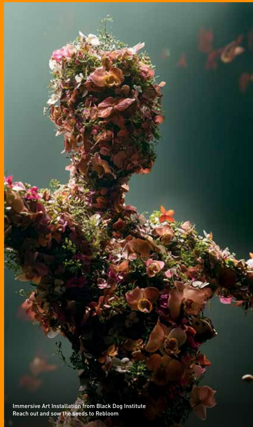
Immersive Art Installation from Black Dog Institute Reach out and sow the seeds to Rebloom